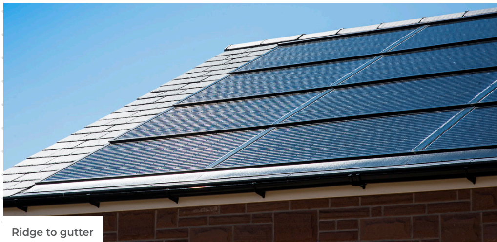
Ridge to gutter

Cost saving No need for slates or tiles under the array saving money.