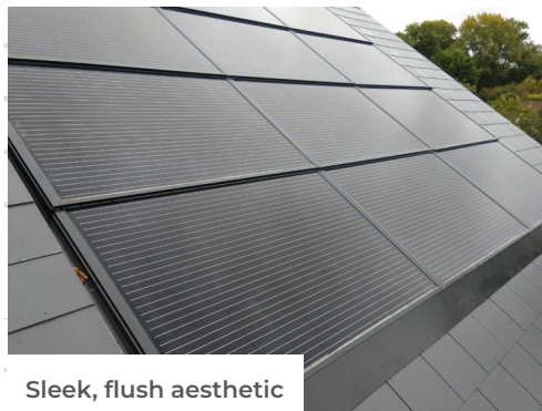
Sleek, flush aesthetic