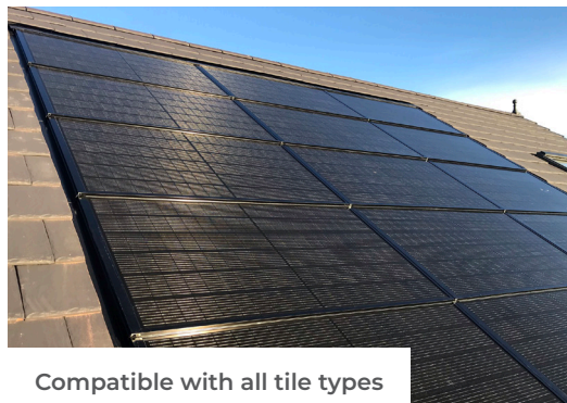
Compatible with all tile types