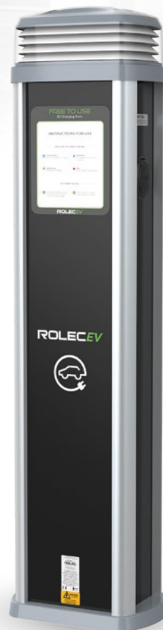
Unit shown: QUANTUM:EV SUPERFAST 2way Socket (Type 2) Charging Pedestal

The QUANTUM:EV SUPERFAST pedestal offers a blend of quality and value, and has been specifically designed to provide both style and flair. Its unique LED louvered amenity lighting safely guides EV drivers to their charging point during the hours of darkness. The unit's custom branding options also provide the perfect blank canvas for company logos, colours, etc.