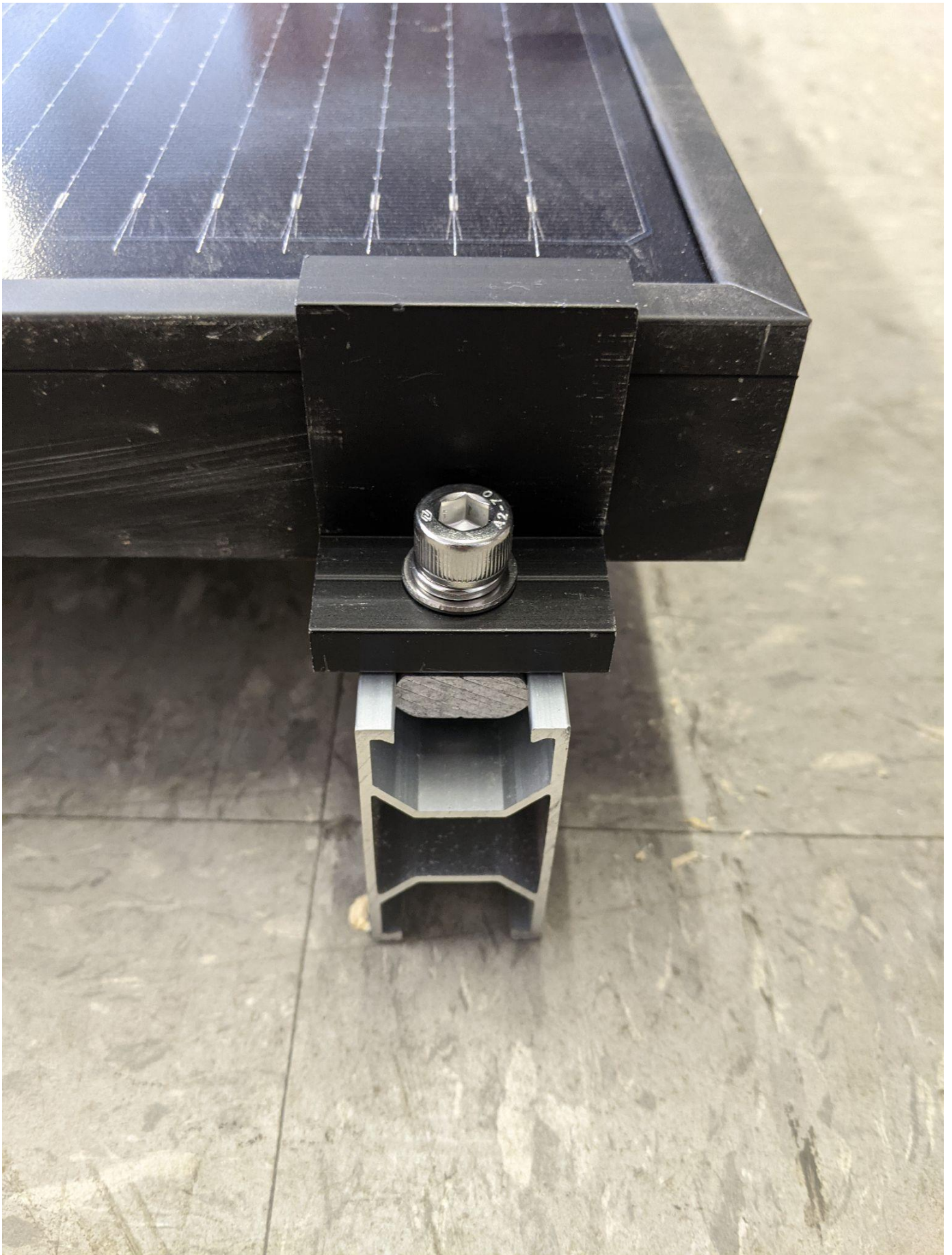
Clamp the rails to the underside of the solar module using the provided clamps.