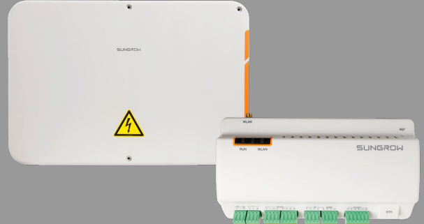
COM100E incl. Logger1000 B connects up to 30 devices