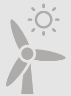
Solar & Wind