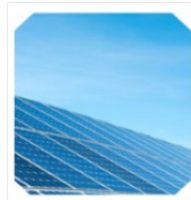
Commercial PV & Storage