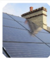
Domestic PV & Storage