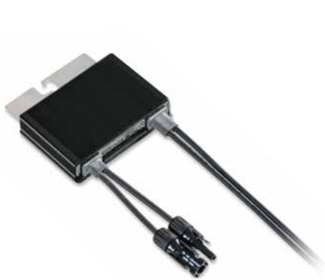
Power Optimiser Per Module

The SolarEdge cloud-based monitoring platform allows monitoring of the house electricity consumption and self-consumption in addition to the PV production. This feature is integrated into all SolarEdge inverters and requires only a connection of a Modbus meter, available from SolarEdge. Consumption monitoring allows you to adapt your electricity consumption to the PV production, thus increasing self-consumption and minimising electricity expenditure.