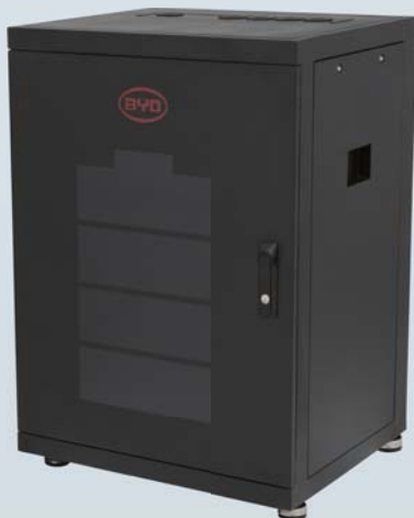
B-Box Pro 2.5~10.0