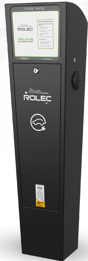
Unit shown: AUTOCHARGE:EV SUPERFAST 2way Socket (Type 2) Charging Pedestal

The AUTOCHARGE:EV SUPERFAST is a heavy duty, hard wearing EV charging pedestal, specifically designed and manufactured for both commercial and public facing environments.