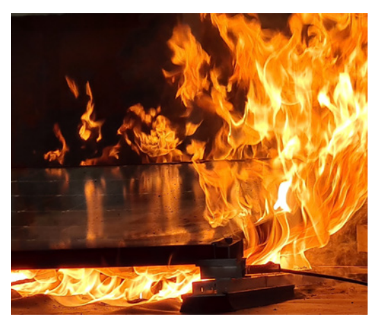
Arc-induced fire under flat roof mounted solar at ZAG fire testing laboratory

BIPV solar installations are one application for the ArcBox since DC cabling is installed near combustible building materials. Flat roof solar installations above roof coverings such as single ply membrane or ashphalt is another. Some buildings, if put out of use even temporarily, would have high knock-on consequences - hospitals, schools, care homes, and factories are applications where risks must be carefully controlled.