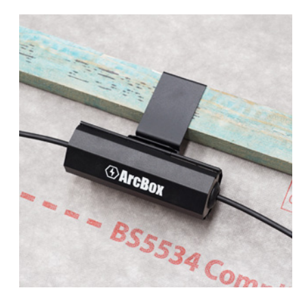
Slot onto a mounting bracket - see below