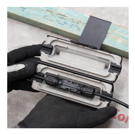
Place DC connector into enclosure with cables laid in grommet