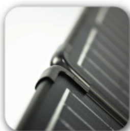
— product details —